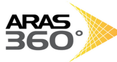
ARAS 360 Technologies, Inc.