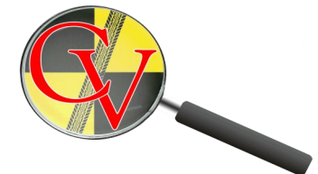
Closing Velocity, Inc.