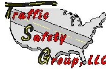
Traffic Safety Group LLC