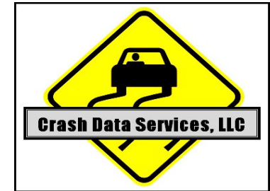
Crash Data Services LLC